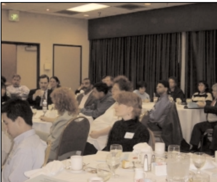
A Packed House! (39 attendees)